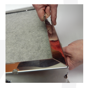
Grab one handle and the back of the frame and pull to separate the components.