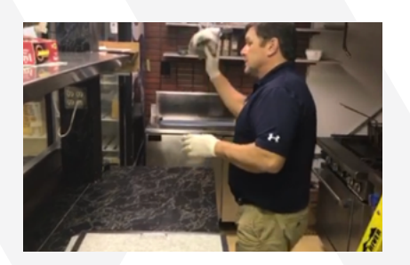
Dispose of used filter in standard trash. Wool is biodegradable, there is no special disposal required.