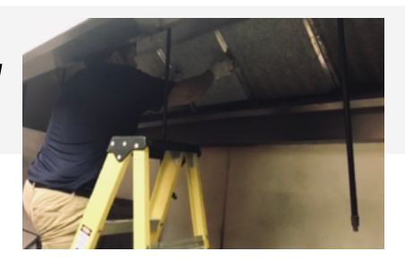
Using the handles, place the filter back into your system. Make sure the handles are on the sides (not top/bottom).

Have questions? Please call us at 520-460-6331 or visit us at knightserviceco.com