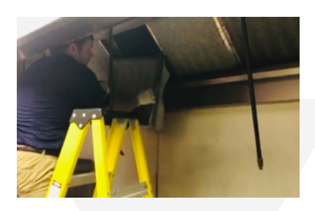
Grip the handles firmly to safely remove the filter from the hood.